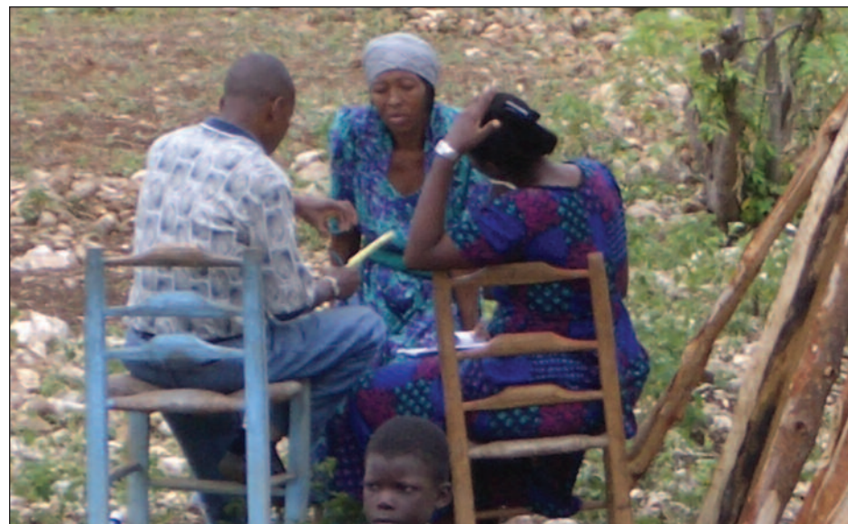
A member of the Haitian behavioral health disaster response team, trained by Loma Linda University International Behavioral Health Trauma Team, works out in the open with victims of a landslide that buried an entire village in 2004. The LLU team provided supervised field training to the Haitian behavioral health disaster response team. Their training is being tested in the current earthquake disaster.

In such a situation, the first order of business