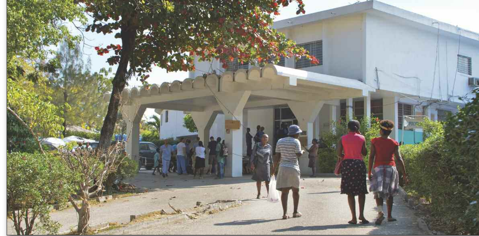
Hopital Adventiste d'Haiti withstood the many tremors of the January earthquake and is currently among the best hospitals in all of Haiti. ▲