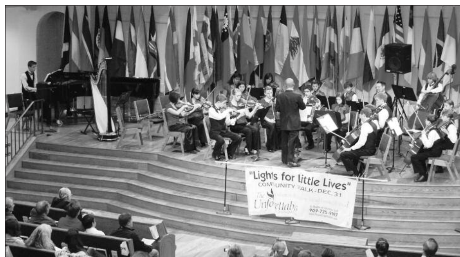
The Young Musicians Ensemble, a youth orchestra centered at the LLU Church, performed several numbers for the special service in the Campus Hill Church.