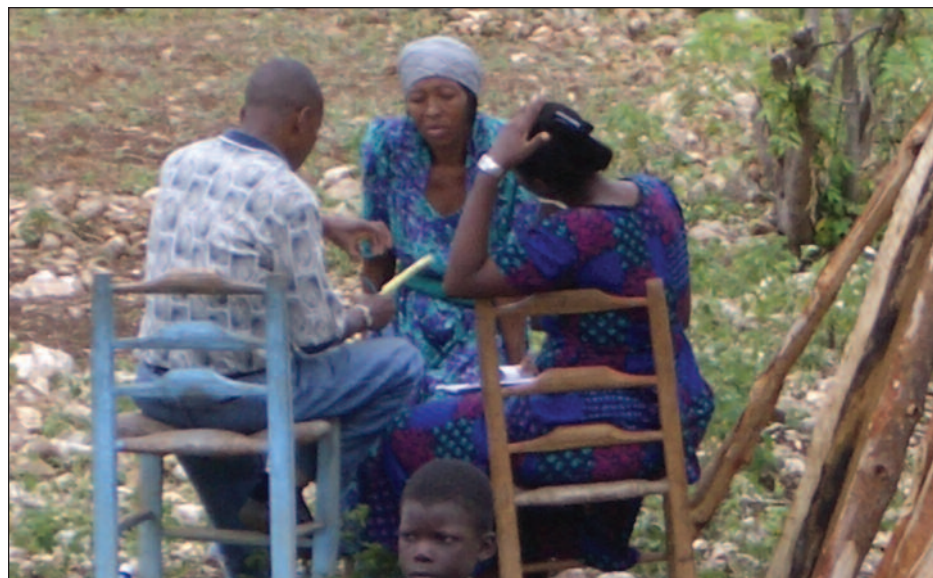
A member of the Haitian behavioral health disaster response team, trained by Loma Linda University International Behavioral Health Trauma Team, works out in the open with victims of a landslide that buried an entire village in 2004. The LLU team provided supervised field training to the Haitian behavioral health disaster response team. Their training is being tested in the current earthquake disaster.

In such a situation, the first order of business