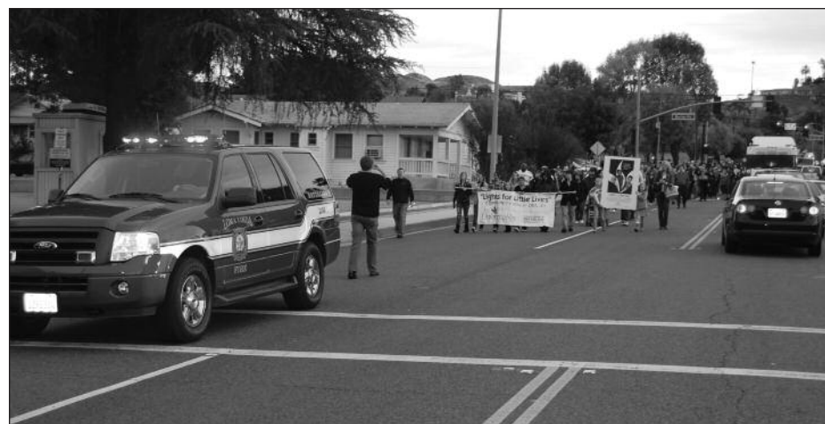
The walkers stopped traffic along Anderson Street, though there wasn't that much traffic to stop on New Year's Eve. However, several newspaper reporters were on hand to record the event through photos and articles.

"Most important of all, I hope the reader will come to a greater reliance on the leading of the Divine in the given situation. God bless."