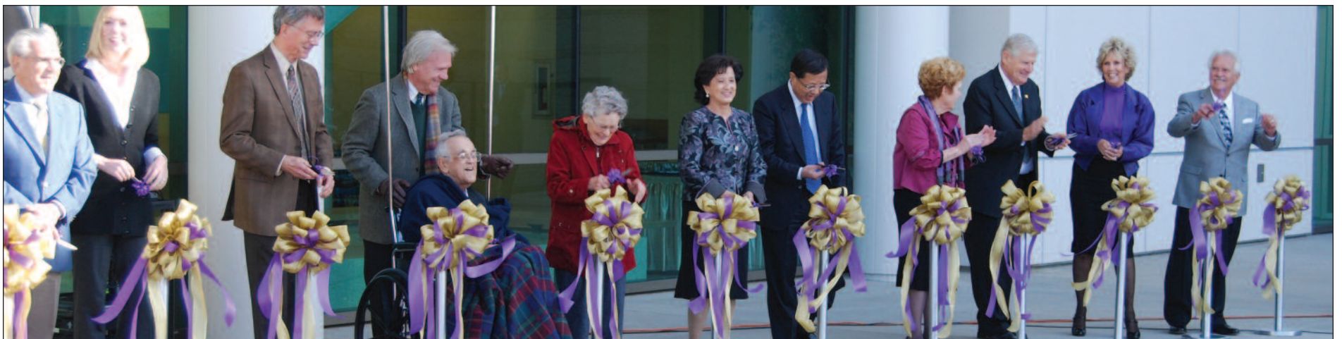
Major donors cut their ribbons alongside Loma Linda University past and present administrators, signifying the official opening of the new Centennial Complex. The grand opening celebration took place on October 28, 2009, commemorating the first building on campus where students from all schools mingle for classes.

The School of Public Health inaugurated a new state of health geoinformatics education center on December 7. The new space in the Centennial Complex doubles the capacity of the former lab and features the latest advances with which to teach students to use geospatial thinking and technology to aid in solving health problems.