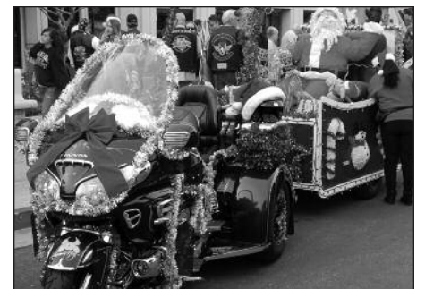
Santa's sleigh took on a different look as the Motorcycle's Rider's Association brought gifts to LLU Children's Hospital patients.